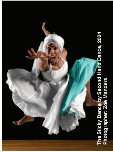
The Sticky Dance by Second Hand Dance, 2024