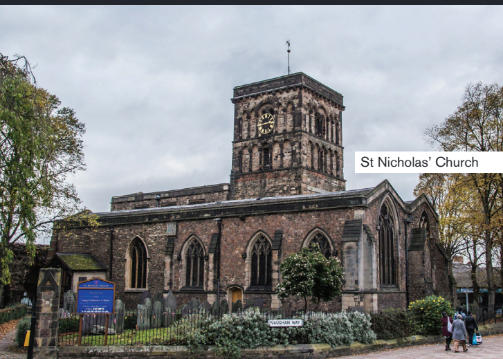
St Nicholas' Church

Built in 1423, the Turret Gateway separated the Newarke religious precinct from Leicester Castle. Locally it is also known as Rupert's Gateway, as Prince Rupert and King Charles I commanded the royalist army that captured Leicester Castle in 1645 during the English Civil War.