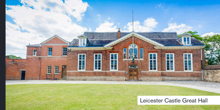
Leicester Castle Great Hall