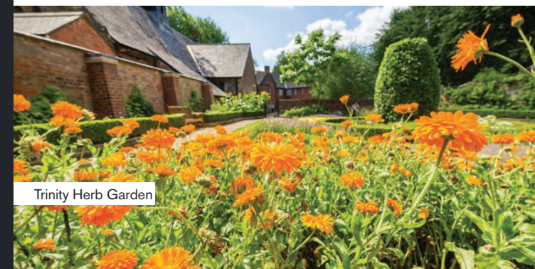
Trinity Herb Garden

The herb garden at Newarke Houses Museum is one of the oldest gardens in Leicester. Together with a later Regency style garden, they provide a beautiful haven for rare plants and wildlife. The Newarke wall can be seen in the garden, complete with gun loops used to defend the area during the English Civil War.