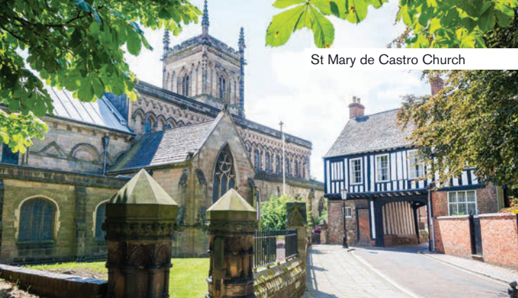
St Mary de Castro Church

Clustered around The Newarke and De Montfort University campus, just minutes from the city centre, are remarkable buildings that tell the story of Leicester from its Roman origins to its manufacturing heyday.